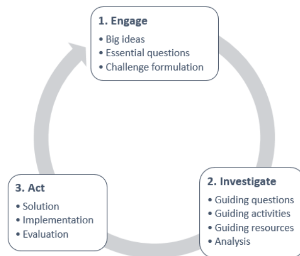
Figure 2. Stages of challenge-based learning implementation (adaptation based on the description by [63] and ECIU university project).

Challenge-based learning is a pedagogical approach that actively engages learners by integrating formerly traditional learning courses with real-life challenges. Those challenges require innovative, creative, and at least multidisciplinary interventions to be solved. These interventions may require learners and external stakeholders as well as training partners (industry or public sector based) to work together. This co-work may continue after the academic period is formally over (e.g., [61,62]). Even though CBL shares some key features with PBL and PjBL, it goes beyond in that the challenge is not fully predefined, as learners and the community members participate in its co-creation, but are also expected to be the expert of the subject, and the teacher just facilitates and accompanies the learning [62]. CBL asks learners to formulate a problem and relevant questions, to investigate compelling issues, to reflect on their learning and the impact of their actions, and then to publish their solutions to a worldwide audience. Following this, the learning and teaching activities in CBL are often divided into three interconnected phases (see Figure 2).